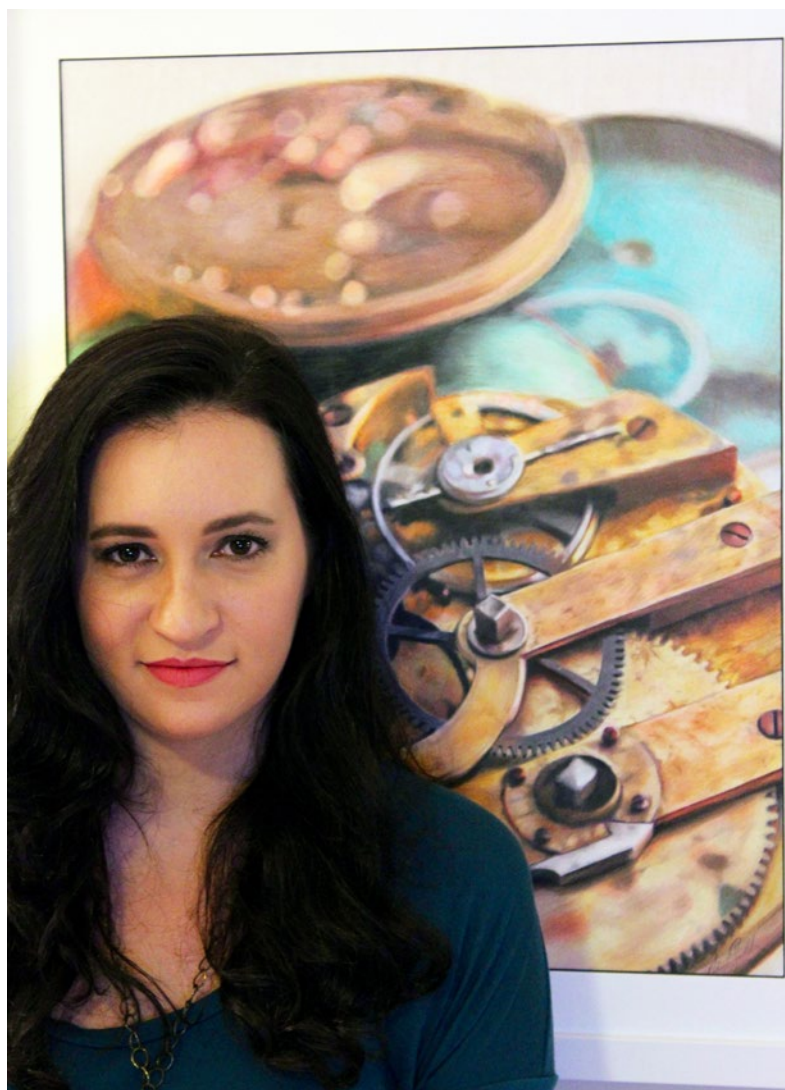
"Without Restraint" 24x19"