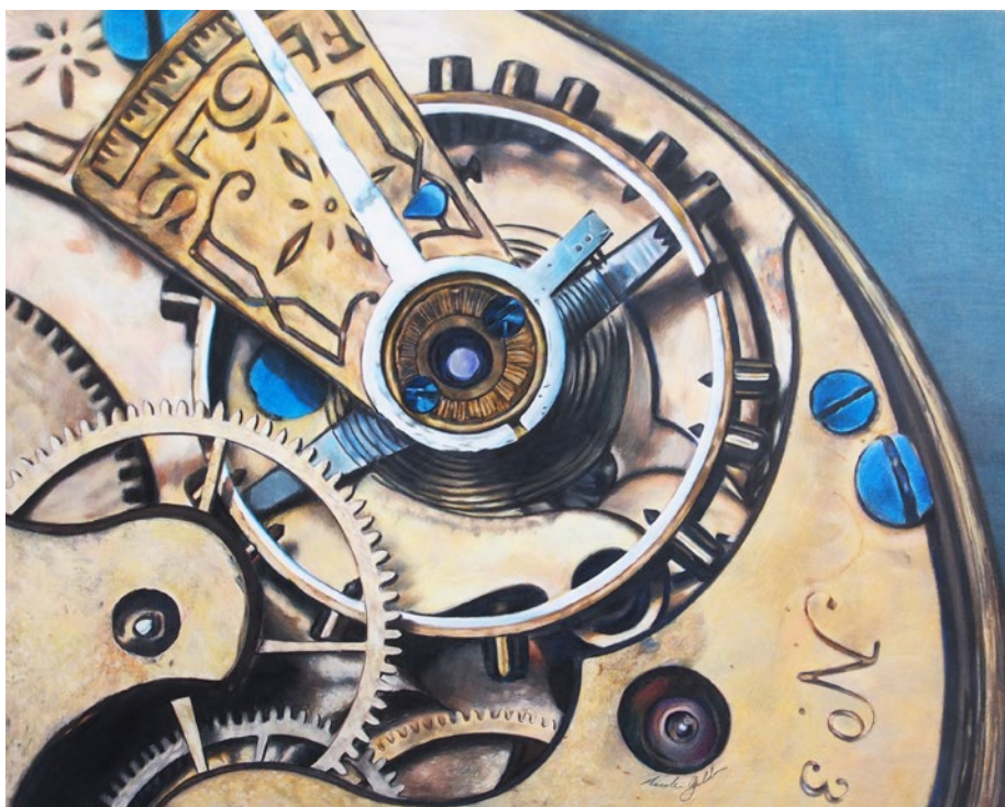
"Spring Forward" 19x24"

On one level, timepieces are somewhat of a practical matter for people to keep track of time with, and certainly they were more common for men than women in the past. But, for me, these drawings are less about the practicalities of time keeping and more about the inability to control it.