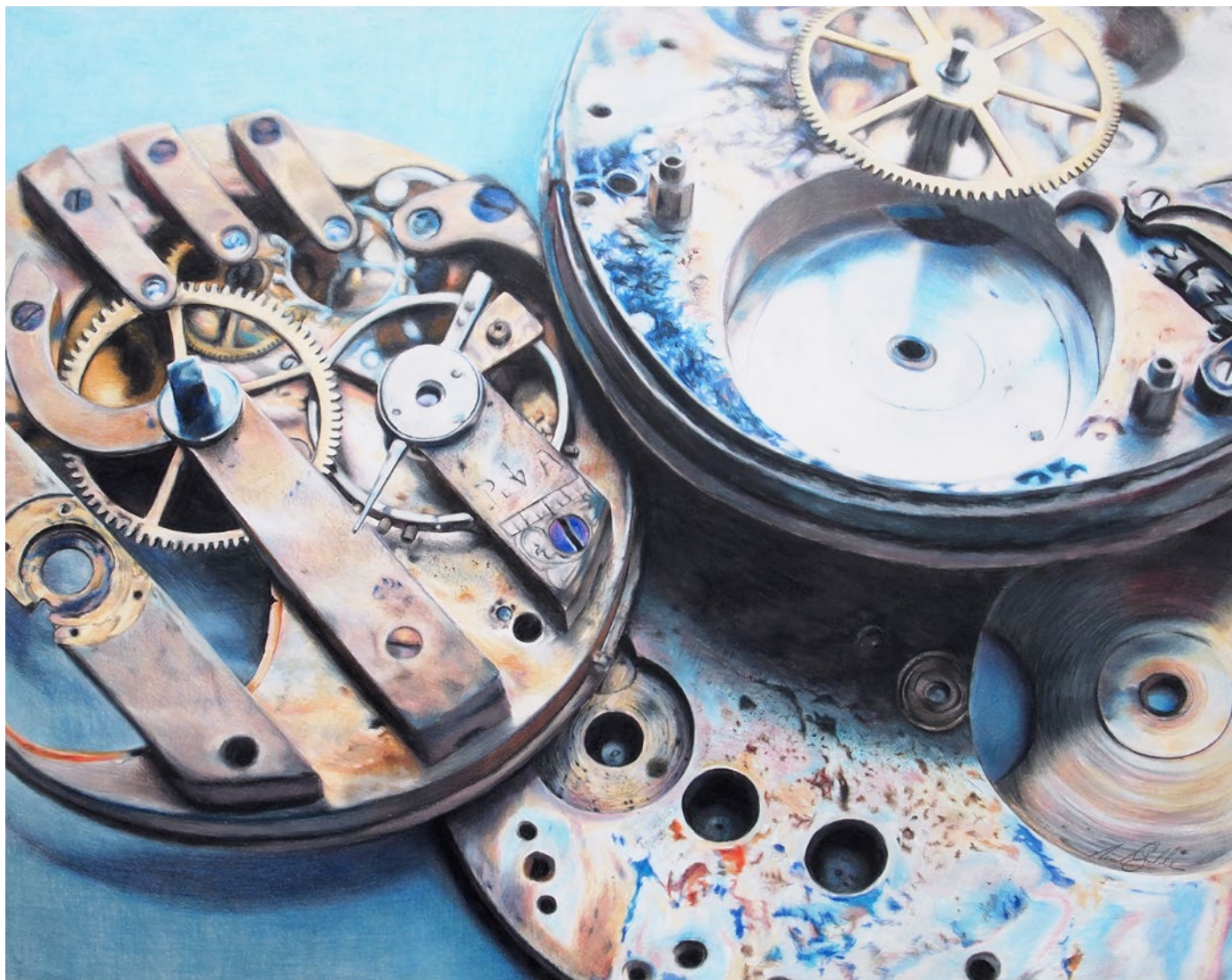
"Been Thinking Too Much" 19x24"

In 2012, I was introduced to steampunk, a genre of science fiction which often includes the use of gears. The subject matter came into my life at exactly the right moment.